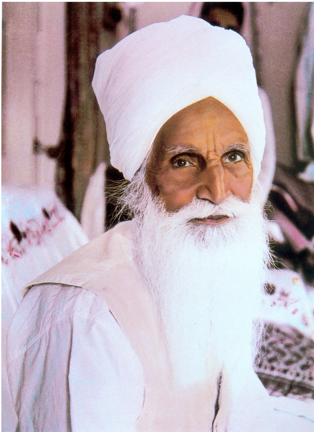
Sawan Singh Ji Maharaj (1858-1948)