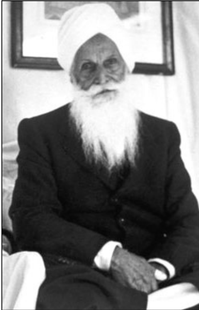
Baba Sawan Singh Ji (1858-1948)