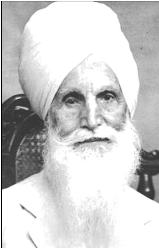
Baba Sawan Singh Ji (1858-1948)