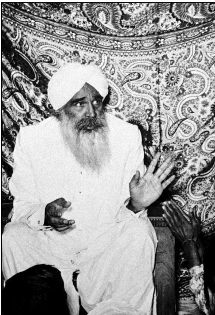
Sant Kirpal Singh Ji (1894-1974)