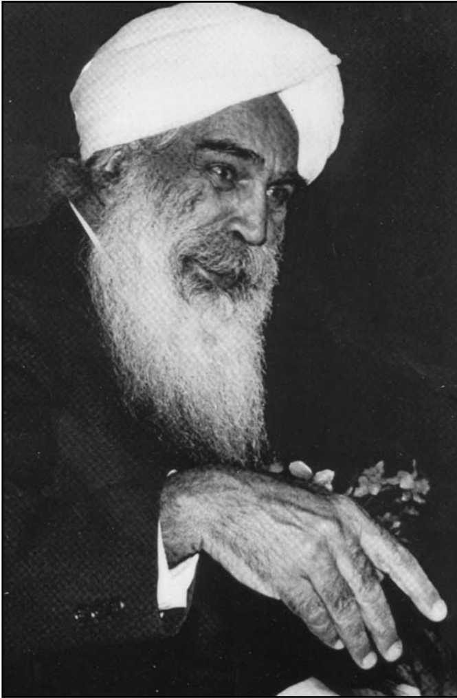
Sant Kirpal Singh Ji (February 6, 1894—August 21, 1974)