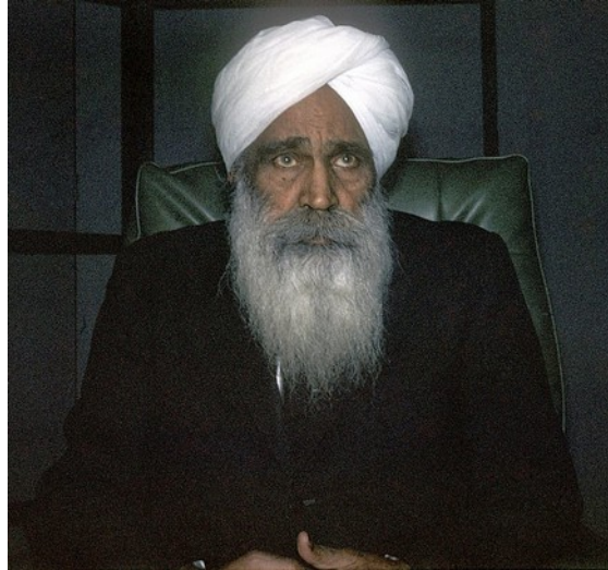
1963 Television Interview Fresno, Ca

May I put a question to you? You have been putting so many questions to me, may I also put one question to you?—Well, do you permit me?—Alright; if the time runs short, what should we do to lengthen it? —Put chains on the legs of time. We have had a good time for two days; so only one day is left—only one day. You can have the sweet remembrance with you; that can prolong it—constantly—not to forget it!