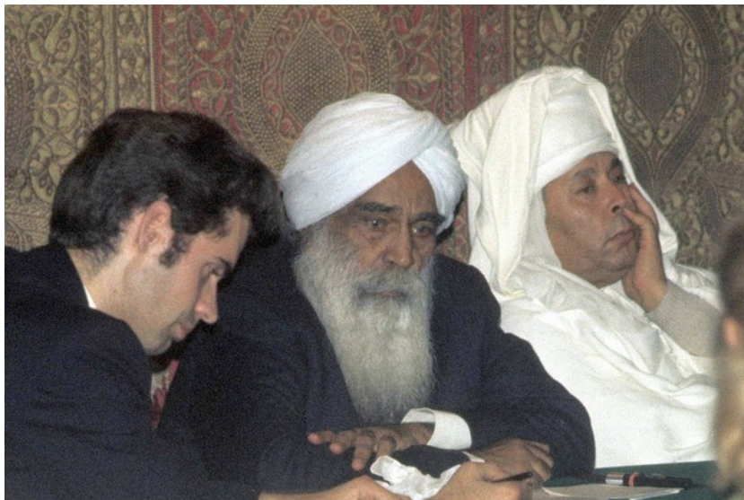
1972 Tour: Paris

A genuine or True Master is invested with unlimited powers from God and is chosen to distribute and extend His unbounded grace and mercy to any one coming with a sincere heart in his or her search for the Way back to God. When he or she is accepted, the Master knows how to correct, mold and uplift that soul, for the soul is of the same essence as that of God and the Master looks on all as embodied souls. So all are dear to Him and He wishes them to reach the True Home of the Father. Even a repentant sinner coming to Him with a sincere heart is acceptable to Him. We are all sinners. We come to Him in order that we may be cleansed.