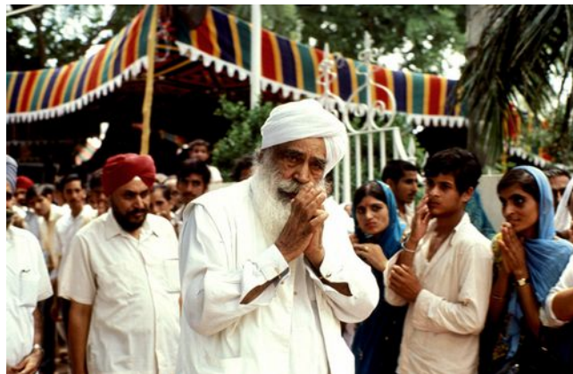
After last Satsang - August 11, 1974

He infers that, like others, he also was drowning, with attention steeped in the poisons of the senses; like a heavy stone which can only sink to the bottom. When he came to the feet of his Guru, he was lifted out of his plight. That great Controlling Power which is God cannot be seen—my fingers are holding this watch, but who is holding it? I am—not the body. So God is in those realized souls; and when the seeker goes to the Master's feet, it is God's mercy that works through him. There is hope for everybody. Every Saint has his past, and every sinner a future. You are human, remember. When did you become a Hindu, Muslim, or Christian? All religions were made after the advent of some Master. Expert guidance is needed from one who knows how to get out of this “physical well.” He who knows not this secret can never help others to find it. The scriptures are full of the words of these Great Masters, and are there for your guidance and action.